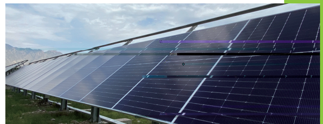
Figure 3. The project picture

Figure 3 shows the project picture of the solar panel installation in Yinchuan, Ningxia.